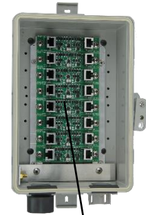
Tower Mount Style – 8 Circuits