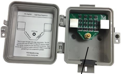
Outdoor Mount Style – 1 Circuit